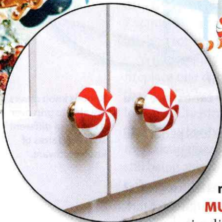
There are six different Knobēz seasonal/holiday collections.