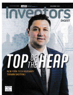
ON THE COVER