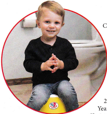
Potty Safe is currently available in light gray, pink and yellow.

Cassville, Missouri, and Buttercup Baby in Pasadena, California. Our locations are growing every day!