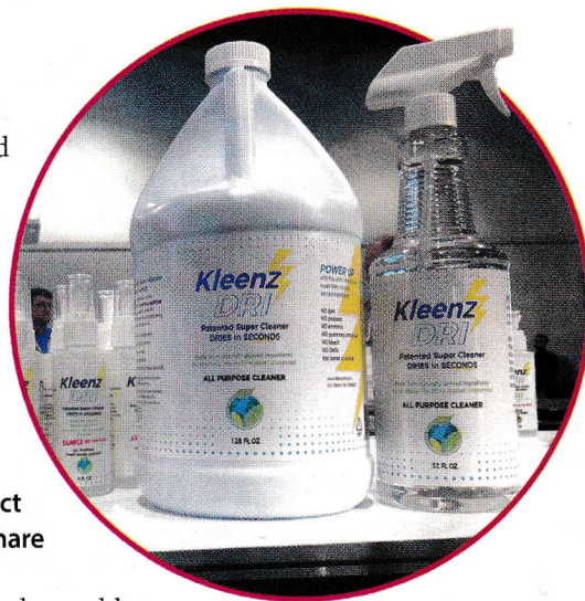
KleenzDRI comes in a gallon size and quart spray bottle.

We have tested extensively in our restaurant over the past three years in our kitchen, the fountain drink machine area, countertops and floors, with