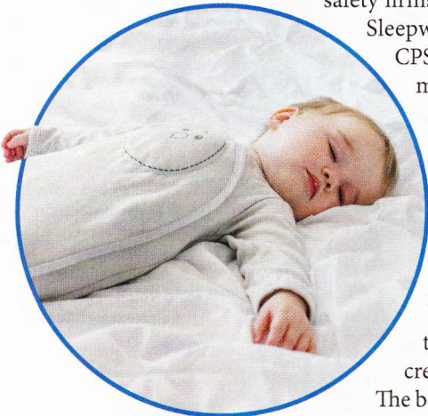
Zen Sleepwear has a brand mission of sleep wellness.